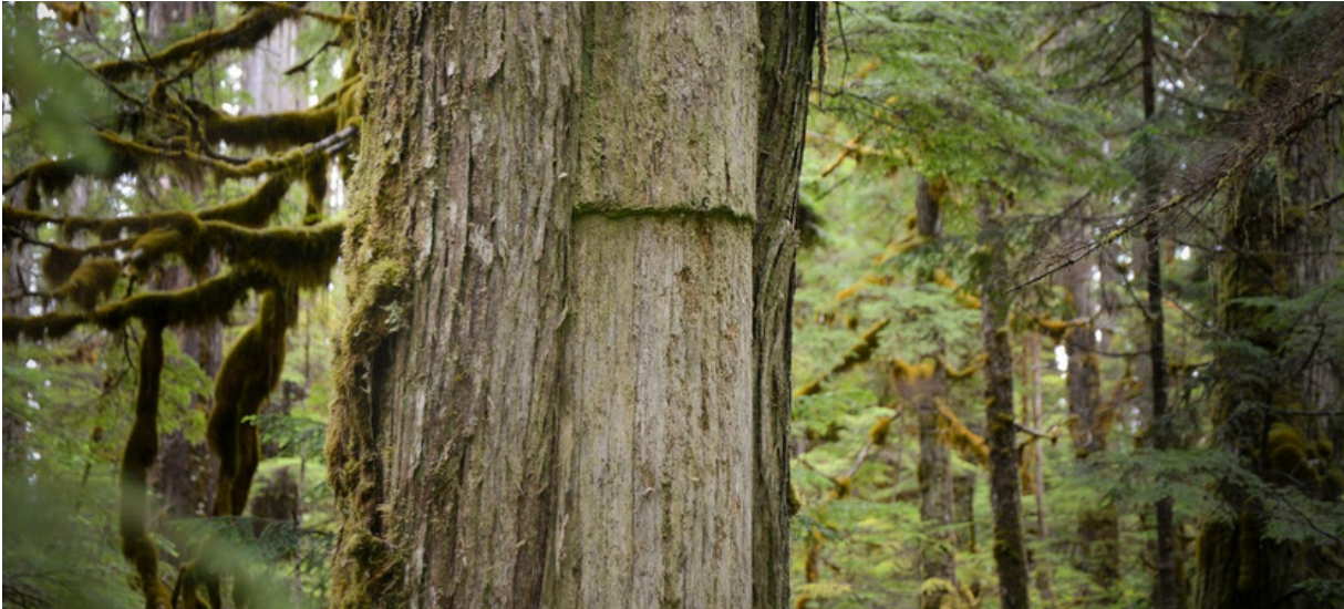
Culturally modified tree.

This land has served past communities and we are thankful for this connection with the land.